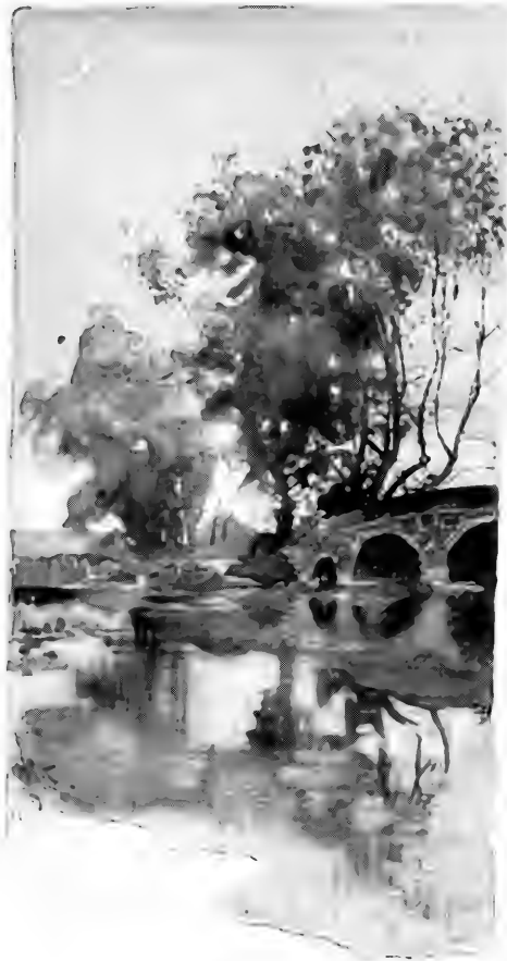
"THE NEW MOON'S MODEST BOW GROW BRIGHT.—Page 98.